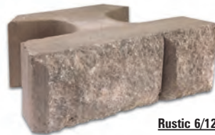
Rustic 6/12 Size: 6" H x 18" W x 12" D Weight: 60 lbs.