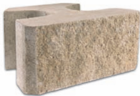
Straight Split 18

Unit specifications, availability, color, and fascia options vary by manufacturer. Please contact your nearest Rockwood manufacturer or dealer for more information.