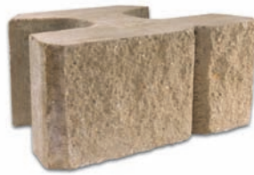
Straight Split 6/12

Size: 8" H x 18" W x 12" D Weight: 80 lbs., 36 kg